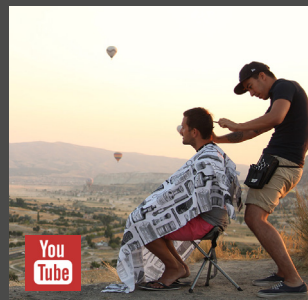
THE NOMAD BARBER