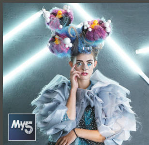
EXTREME HAIR WARS