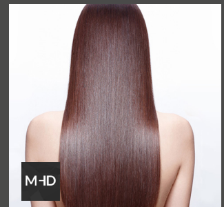
TRAINING VIDEOS AT: MYHAIRDRESSERS.COM

Use these websites to help you with the tasks below and develop your understanding of the sector: