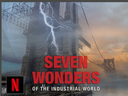
SEVEN WONDERS OF THE INDUSTRIAL WORLD

Watch one (or more!) of the documentaries below about the feats of engineering: Available on YouTube, UKTV Play or Netflix.