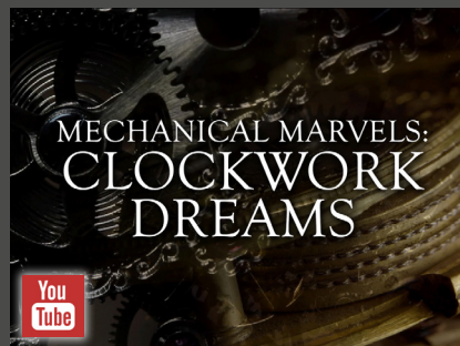
MECHANICAL MARVELS: CLOCKWORK DREAMS